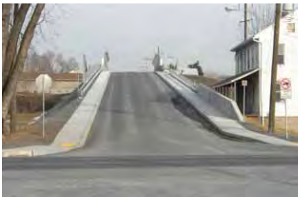
Burd Street Bridge in Royaltown, dedicated as the Judith Deighton Oxenford Bridge, cost approximately $4.5 million.