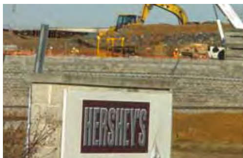
Expansion of the Hershey Chocolate plant in Derry Township.