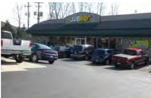
Subway, located on Main Street in Hummelstown.