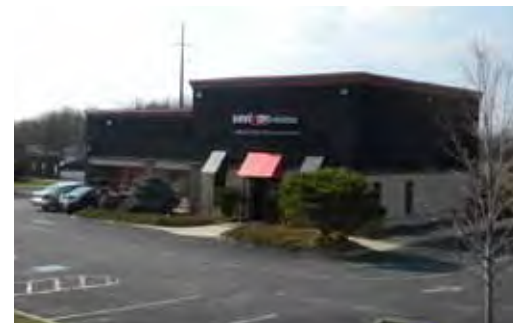
Verizon Wireless, located along Mae Street in Derry Township.