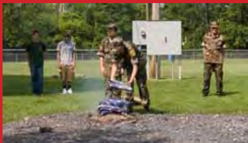
During the Flag Retirement Ceremony on June 12, 2010, cadets properly retired American flags.

Residents who have flags in need of retirement are encouraged to drop them off at my Hershey office by Wednesday, May 25, 2011. My office is located at 250 W. Chocolate Avenue, Hershey, phone 717-534-1323.