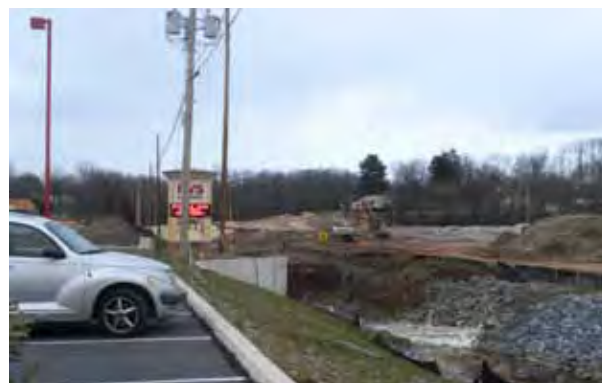
Meade Avenue at Route 230, Lower Swatara Township. Project estimated at $4.8 million.