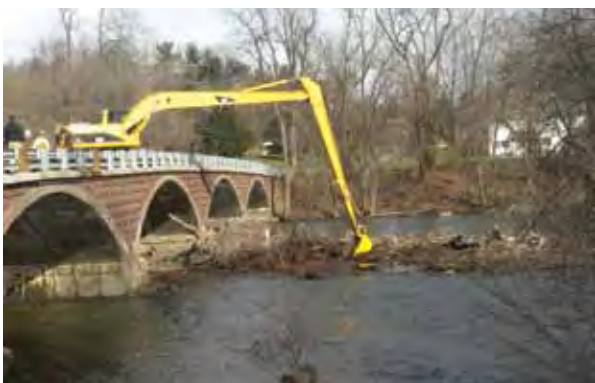
Debris removal, Duke Street Bridge in Hummelstown.