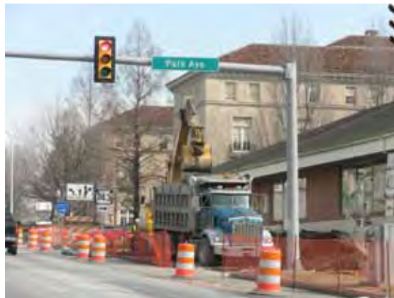
Route 743 Bridge/Route 422 Hershey Square alignment project in Derry Township.