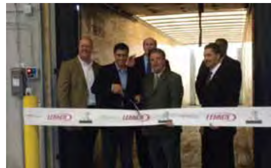
Rep. Payne participated in the ribbon-cutting ceremony at Lennox Industries in Lower Swatara Township.