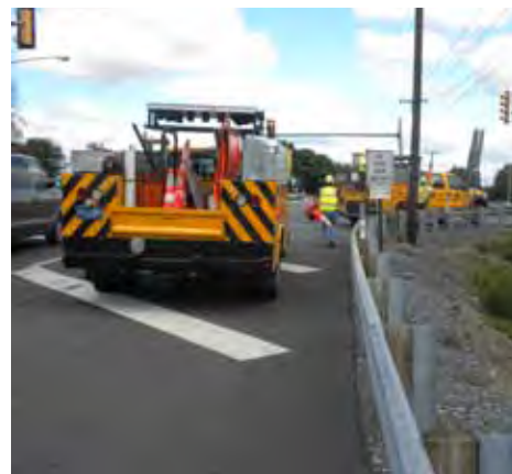
Service road to Route 322, PennDOT guide rail work, Hummelstown.