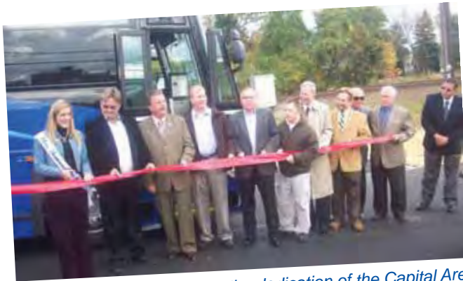
Rep. Payne participated in the dedication of the Capital Area Transit's (CAT) Park and Ride in Hummelstown Borough.