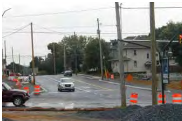
Rt. 422 and Lingle Avenue in Derry Township. Project estimated at $3.2 million.