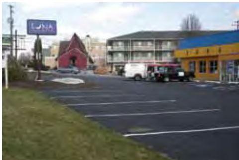
Luna Restaurant, located along Route 422 in Derry Township.