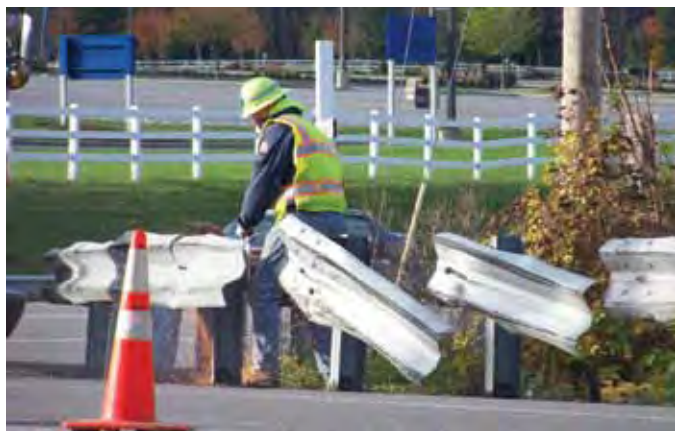
PennDOT guide rail work, Hersheypark Drive and Route 39 in Derry Township.